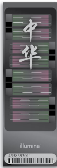
Figure 1: The Infinium OmniZhongHua-8 v1.4 BeadChip — The Infinium OmniZhongHua-8 v1.4 BeadChip provides exceptional coverage of common, intermediate, and rare SNP variants specific to Chinese populations as defined by the 1000 Genomes Project.

The Infinium OmniZhongHua-8 v1.4 BeadChip provides coverage of 77% of common variation (minor allele frequency (MAF) > 5%), 73% of intermediate variation (MAF > 2.5%), and 65% of rare variation (MAF > 1%) in the Chinese population at r^2 \geq 0.8 . This powerful chip provides greater coverage of intermediate and rare variation than the competing CHB array. It also offers equivalent coverage of common variation, making it the ideal starting point for Chinese population GWAS studies (Figure 2).