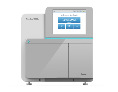
Figure 1: The NextSeq 550Dx Instrument—By leveraging the latest advances in SBS chemistry and user-friendly, regulated workflows, the NextSeq 550Dx instrument delivers high-quality results for both clinical and research applications.

While the NextSeq 550Dx instrument can generate more than 90 Gb of data in less than two days, it also delivers the consistency of a regulated platform and includes robustness improvements in software and instrument design. In addition, running in Research Mode supports all currently available NextSeq 550 System research applications including exome sequencing, transcriptome profiling, customer-designed targeted panels, and microarray scanning. With the NextSeq 550Dx instrument, clinical laboratories can run in