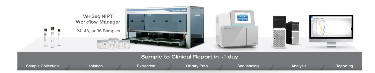
Figure 1: Full IVD NIPT workflow—The VeriSeq NIPT Solution v2 provides everything needed for NIPT using NGS, including reagents for DNA extraction, library preparation, and sequencing; instrumentation for automated library preparation and sequencing with workflow manager software; an onsite server for secure data storage and analysis; and data analysis software capable of generating clinical results.

Based on accuracy of results, time to answer, and failure rates, the VeriSeq NIPT Solution v2 demonstrates excellent performance.