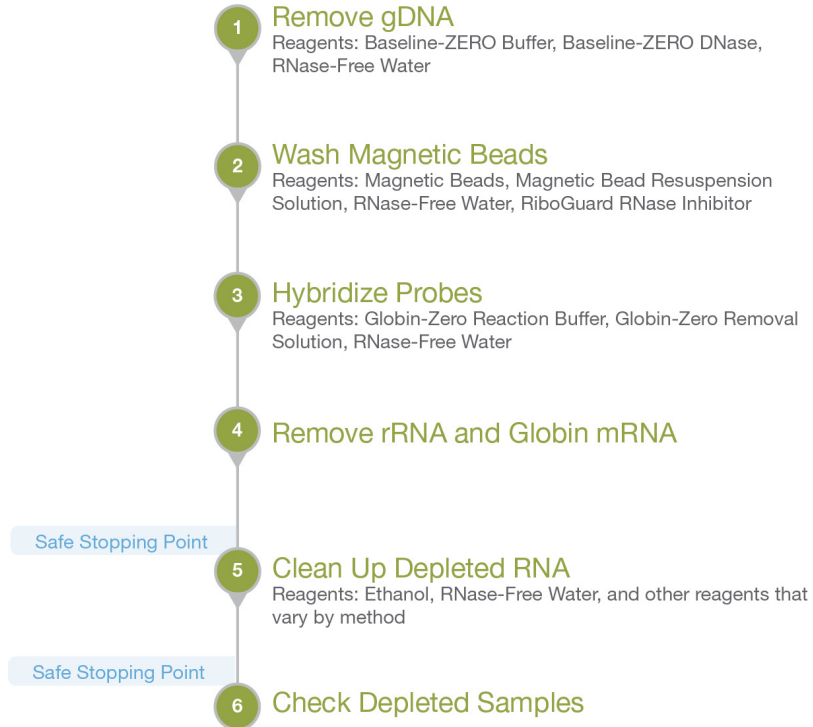
Figure 1 Globin-Zero Gold Workflow

The following figure illustrates the workflow using a Globin-Zero Gold rRNA Removal Kit. Safe stopping points are marked between steps.