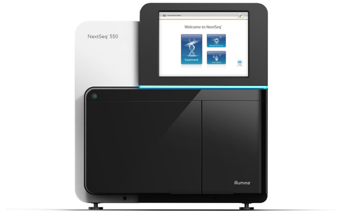
Figure 1: NextSeq 550 System—Proven platform offering the accuracy of SBS chemistry as part of a simplified amplicon sequencing workflow.

The NextSeq 550 amplicon sequencing solution begins with AmpliSeq for Illumina PCR-based library preparation with the AmpliSeq for Illumina Library PLUS kit and targeted gene panels. The AmpliSeq for Illumina Comprehensive Cancer Panel and the AmpliSeq for Illumina Comprehensive Panel v3 are ideal for use on the NextSeq 550 System. Resulting libraries are loaded onto a reagent