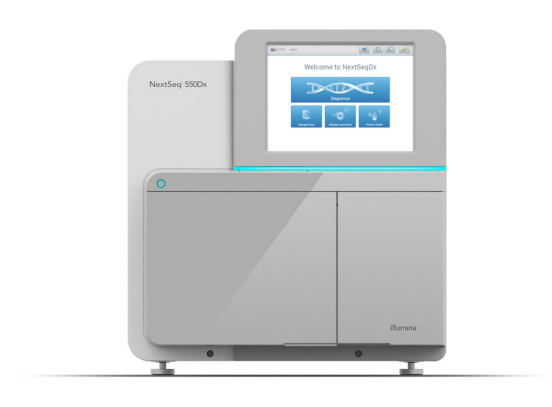
Figure 1: The NextSeg 550Dx Instrument—By leveraging the latest advances in SBS chemistry and user-friendly, regulated workflows, the NextSeq 550Dx instrument delivers high-quality results for both clinical and research applications.

At the core of the NextSeq 550Dx instrument is proven Illumina sequencing by synthesis (SBS) chemistry—the most widely adopted NGS chemistry in the world. This reversible, terminator-based method detects single bases as they are incorporated into growing DNA strands and enables the parallel sequencing of millions of DNA fragments. Illumina SBS chemistry employs natural