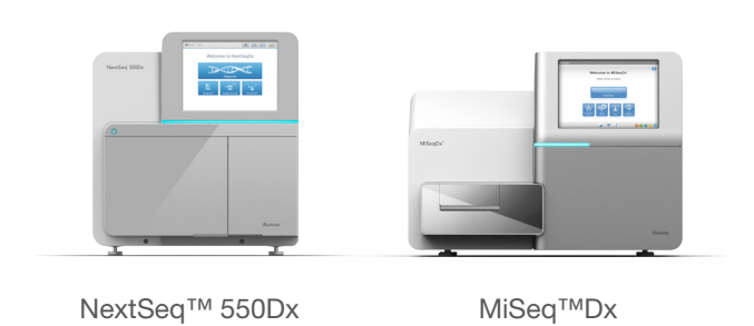
Figure 3: Illumina NGS Dx instruments portfolio—Illumina NGS systems offer solutions for a broad range of applications, sample types, and sequencing scales. Each delivers high-quality data and high accuracy with flexible throughput and simple, streamlined workflows.

The NextSeg 550Dx instrument offers fully integrated onboard analysis software with modular software architecture to support current and future assays. Instrument control software is accessed through a user-friendly touch screen interface. Local Run Manager software supports planning sequencing runs, tracking libraries and runs with audit trails, and integration with onboard data analysis modules. While Local Run Manager runs on the instrument computer, users can monitor run progress and view analysis results from other computers connected to the same network. After a sequencing run is completed, Local Run Manager automatically starts data analysis using one of the application-specific analysis modules.