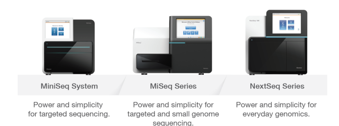
Figure 3: Illumina NGS portfolio of benchtop sequencers—Illumina NGS systems offer solutions for virtually every application, sample type, and sequencing scale. Each delivers high data quality and accuracy with flexible throughput and simple, streamlined workflows. Data can be easily compared, exchanged, and analyzed in BaseSpace Sequence Hub.

Also, sequencing data can be run through a wide range of opensource or commercial pipelines developed for Illumina data, or instantly transferred, analyzed, archived, and shared securely with BaseSpace Mequence Hub. BaseSpace Sequence Hub is the only cloud ecosystem that offers direct instrument integration, enabling automatic encrypted data flow directly from the instrument into the cloud ecosystem for analysis, storage, sharing, and other forms of data management. Additionally, BaseSpace Sequence Hub users can monitor the status of their runs through the cloud portal or through the iOS app for BaseSpace.